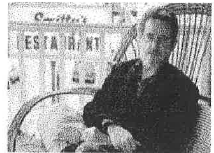
T. R. Hummer

For more information or additional driving directions to UGA go to www.uga.edu .